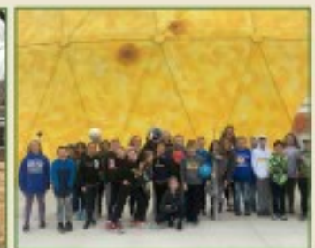
Class visits Solar Walkway