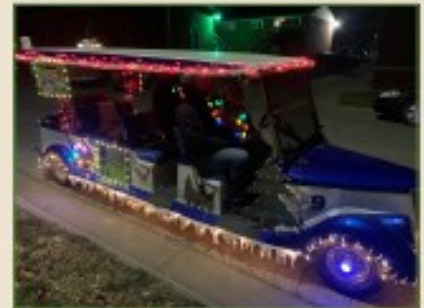
Lighted Christmas Parade