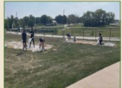
William Penn Student Cleanup Day